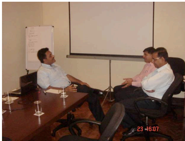
Figure 2 Another group proposing another way to address the PPE issue