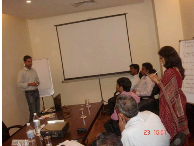
Figure 1 One of the participants during the role play on PPE